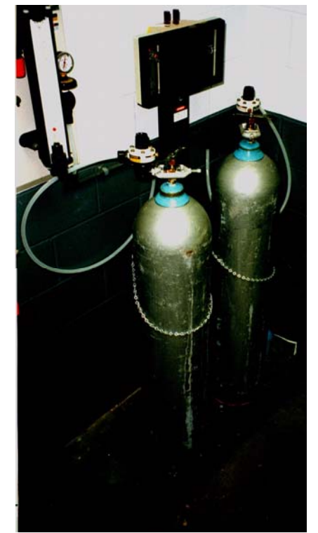
Andalusia Water Works - Well #10 Chlorination Unit