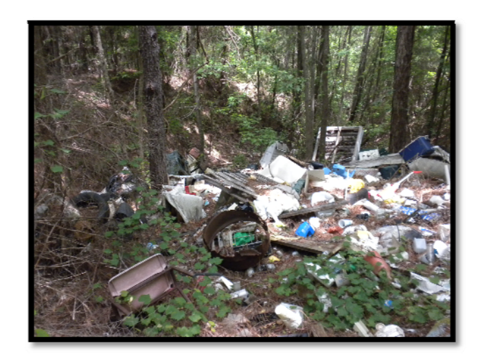
Perry Co. Road 37 Site (Perry County) Pre-Removal

This project was located on County Road 37 near Marion, Perry County, Alabama. The project was conducted by the Perry County Commission, as an interagency cooperative agreement, at a cost of $233,472.52. The project began in August 2013 and was completed in November 2013. The contractor removed and disposed of approximately 690 tons of solid waste material from the site.