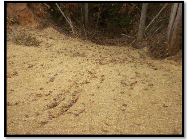
County Road, Jones (Autauga County) Pre-Removal