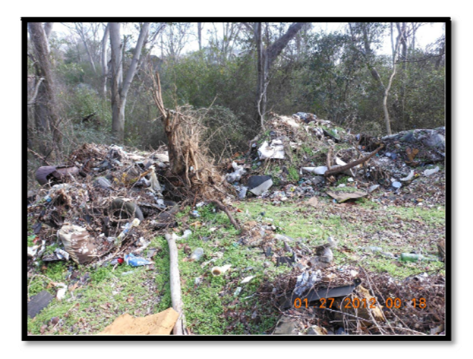
35 Streets, Holt (Tuscaloosa County) Pre-Removal

This project was located on 35th Street in Holt, Tuscaloosa County, Alabama. The project was completed for a cost of approximately $543,000. The project began in February 2013 and was completed in September 2013. The contractor removed and disposed of approximately 2,900 tons of solid waste material from the site.