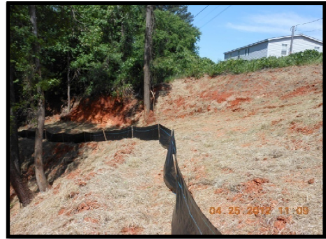
35 Street, Holt (Tuscaloosa County) Pre-Removal