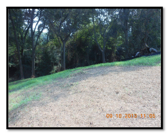
35 Streets, Holt (Tuscaloosa County) Post-Removal