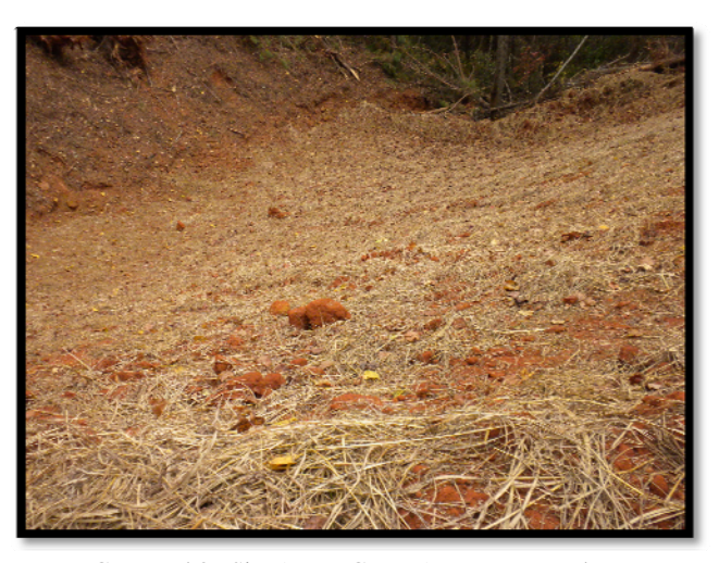
Perry Co. Road 37 Site (Perry County) Post-Removal

The Department completed several remediation projects in Autauga County, including one in the community of Jones, Alabama. The remediation project located along several county roads in Jones was conducted at a cost of $212,730 and was completed in less than three months. The contractor removed and disposed of approximately 1,100 tons of solid waste material.