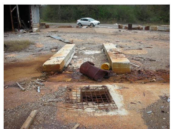
Overview of Drainage Area