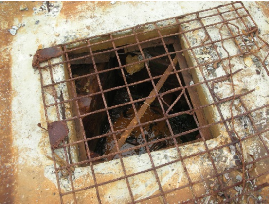
Underground Drainage Pipe