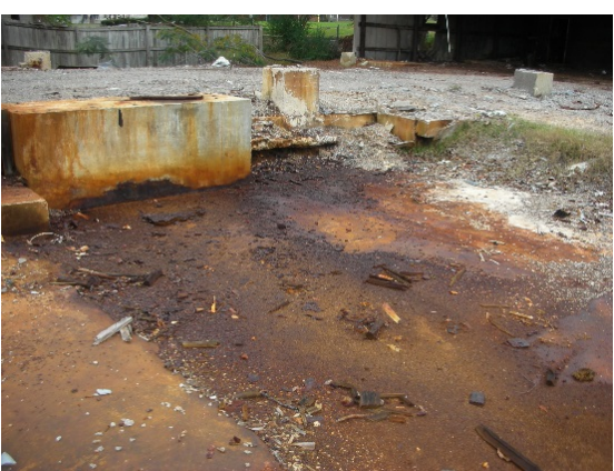
Stained Foundation Area