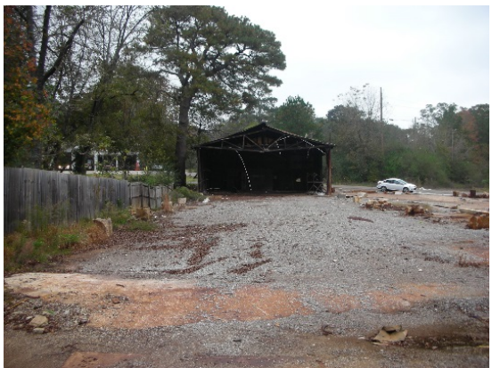
View to Shed from Back Fence