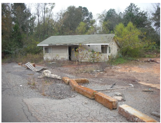
Initial Building of the Business