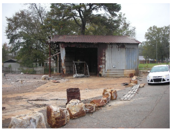
Old Sheet Metal Shed

Another site investigated this past fiscal year was the former Kennedy Galvanizing, Inc. Company. The site is located at 8256 Stouts Road in Morris, Alabama and was found to be a closed and abandoned business that previously used zinc to galvanize pipes, nuts, bolts, angles and beams. The facility at one time contained an alkaline cleaner tank, a hydrochloric acid metal pickling tank, an ammonium chloride rinse tank, a molten zinc vat and a water bath tank. Although all tanks for this property had been removed, there were several places on the site where the soil appeared to have been impacted by facility operations or waste/product storage. Although the former owner/operator had cleared over 90% of the property, a dilapidated metal shed that was literally falling apart remained. The AHSCF investigator was able to contact the owner/operator who agreed to dismantle and remove the shed and any other obstructions left on the site. In addition, the owner/operator agreed to install a fence to prevent the public from accessing the property. After investigating the site and communicating with the owner/operator, ADEM has determined that further evaluation of the site is needed to evaluate potential soil contamination and the need for remedial action.