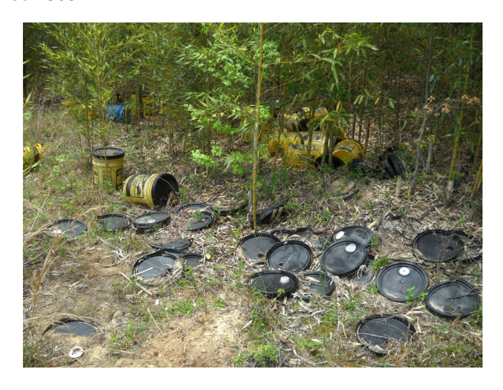
Containers at the Vernon Highway 18 Drum Site