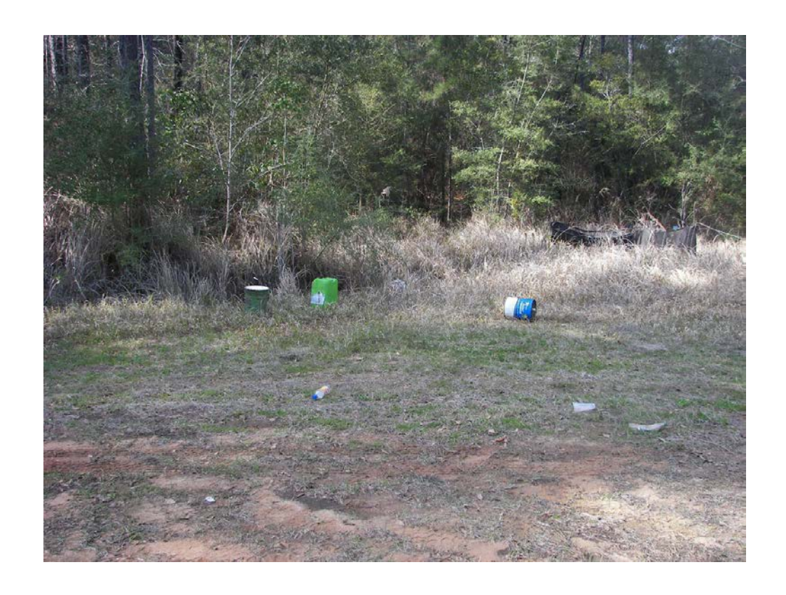
Abandoned containers with used oil at the Bucks Oil Spill Site