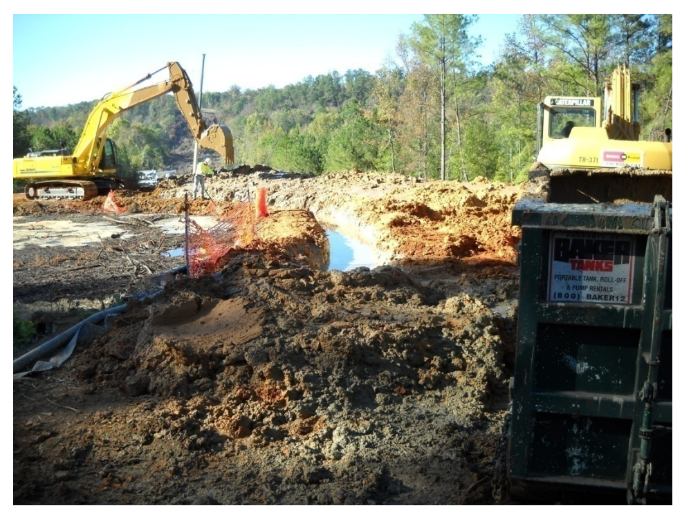
EPA constructing a slurry containment wall around the lagoons