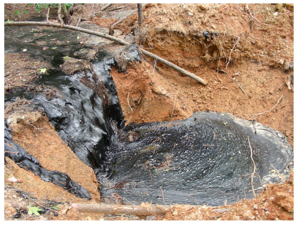
Lagoon runoff collection pit