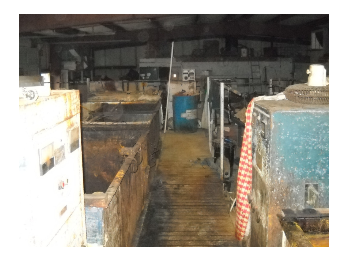
Plating Line Vats at A-1 Plating, Tuscumbia, AL

The A-1 Plating facility is located at 2009 Missouri Street, Tuscumbia, Colbert County, Alabama. This is an abandoned plating operation that the First Metro Bank in Muscle Shoals, Alabama paid the lapsed property taxes prior to foreclosure proceedings. ADEM investigators met with the bank's representative in January 2013 and performed an inspection of the interior and exterior of the Site to ascertain the presence of hazardous materials, waste streams, and associated problems at the abandoned facility. Numerous drums of spent plating solutions, vats of used plating solutions, wash and rinse water, acids, sludges, spills of various sorts, etc... was observed by the investigators. The AHSCF has overseen the cleanup of the Site by contractors for the owners, and are presently awaiting the final sampling results for the slab and the soil around the building. Those results will indicate whether further action will be required at the Site under the AHSCF.