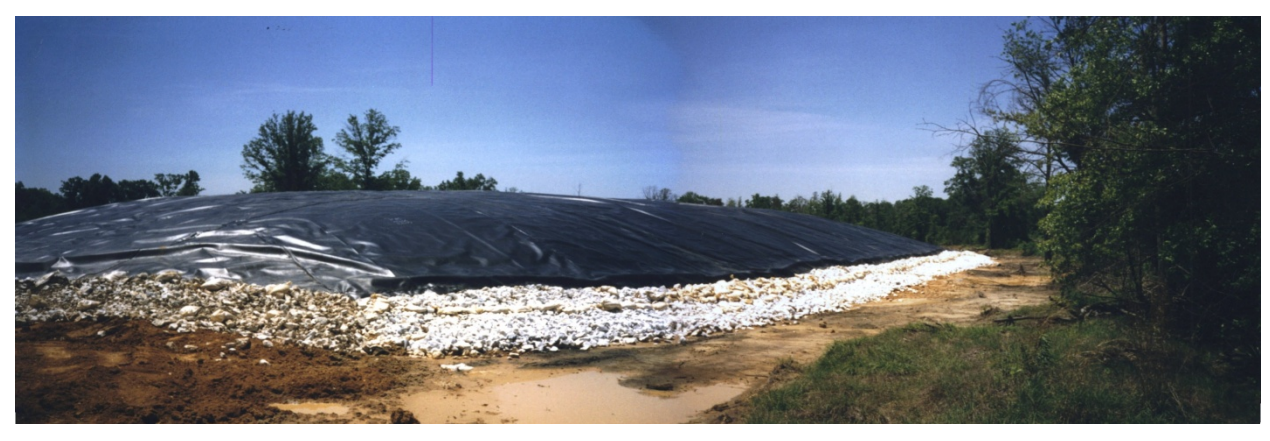
Brass foundry waste staged for removal