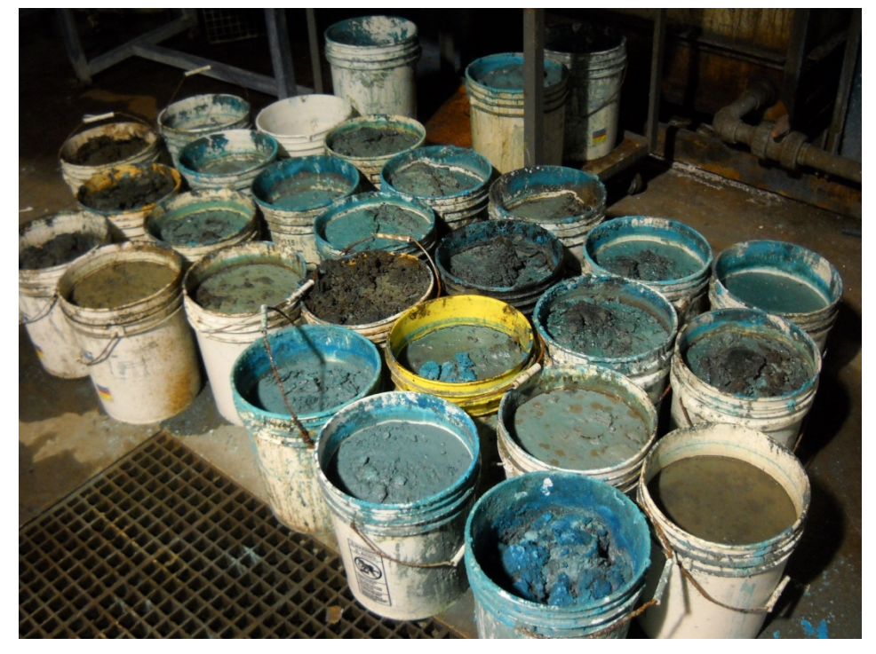
Unsecured 5-gallon buckets of wastewater treatment sludge