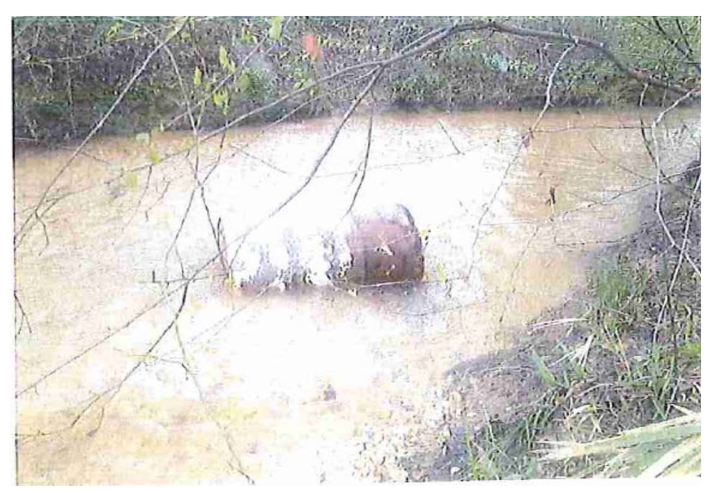
Abandoned Drums at Brensen Creek Drum Site