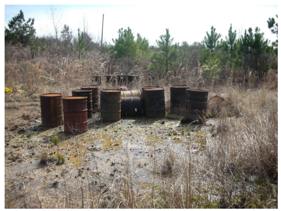
Abandoned drums, prior to removal by unknown party