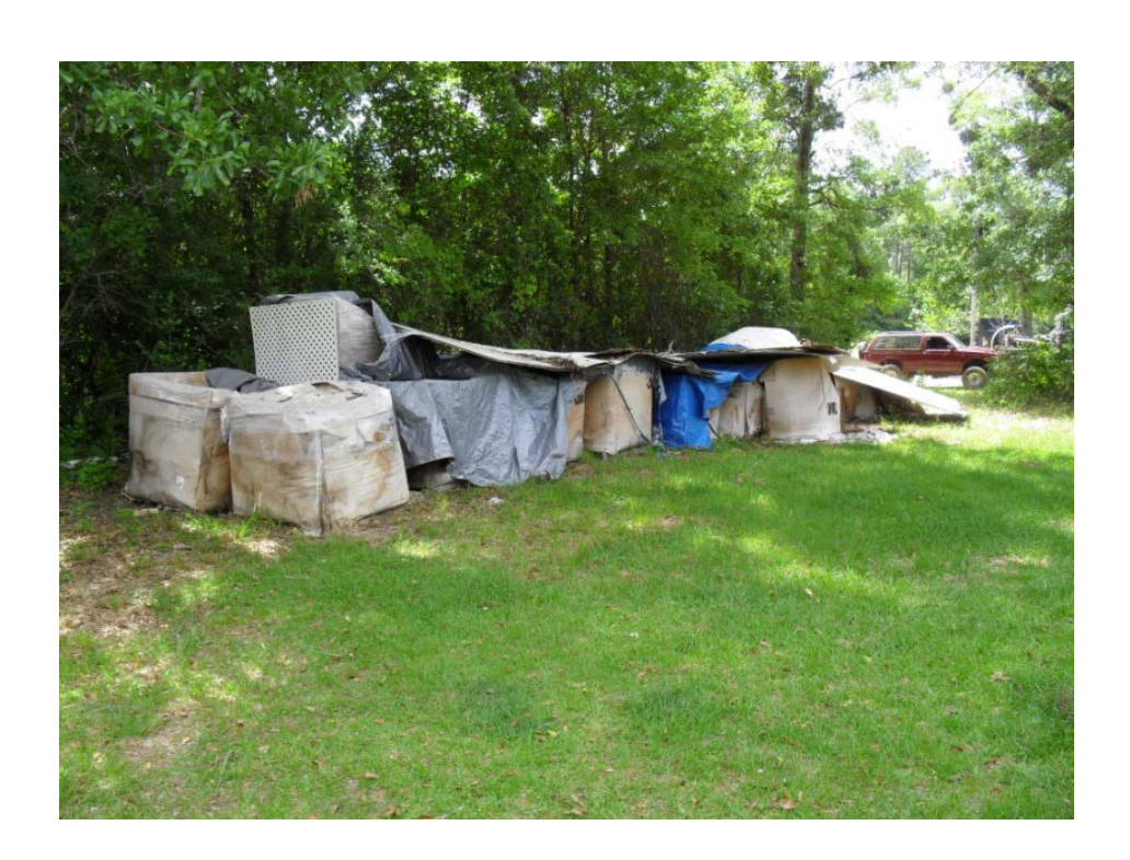
Baldwin County Satellite Site