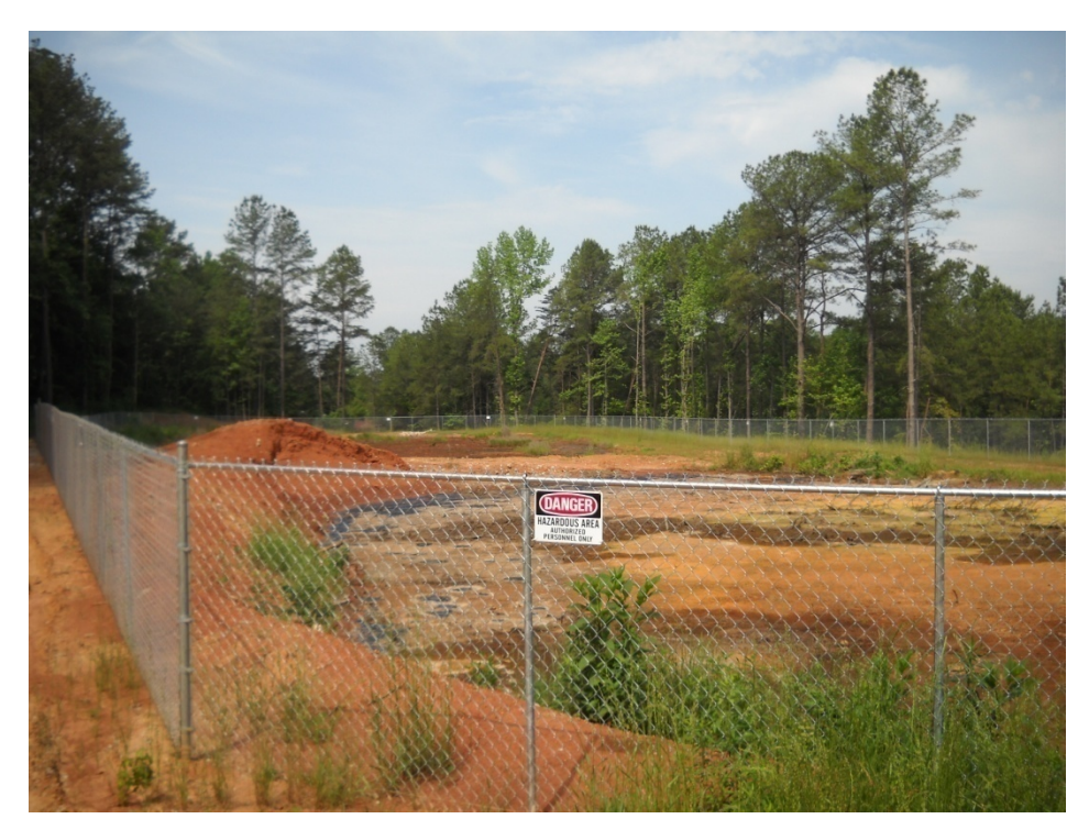
Completed slurry containment wall and enclosure