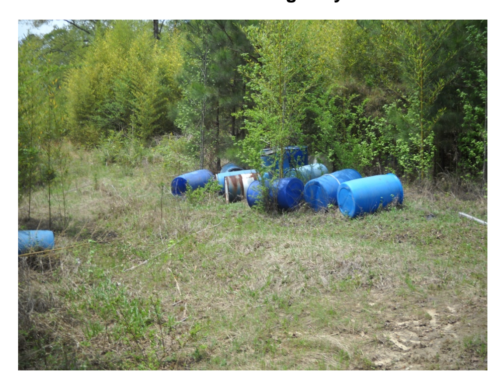
Drums at the Vernon Highway 18 Drum Site