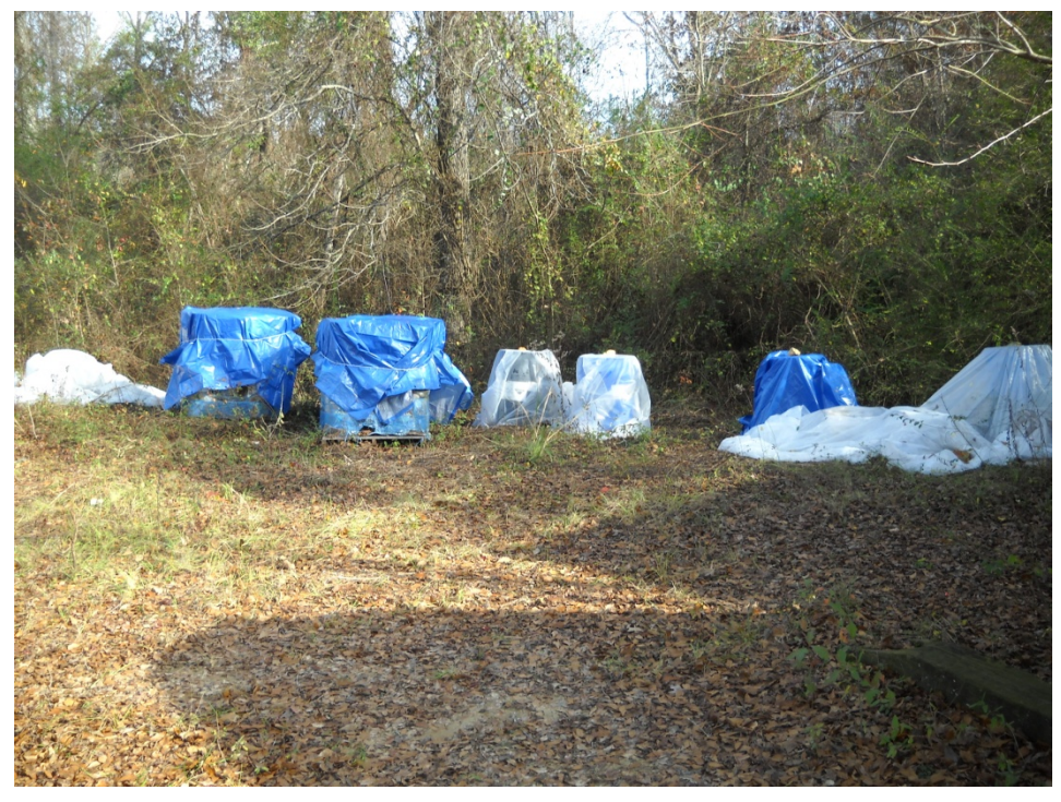
Drums and other containers, secured and staged for removal by EPA