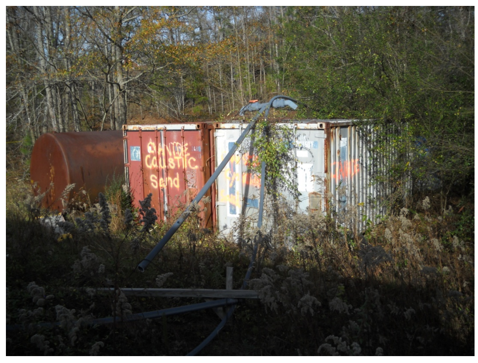
Conex boxes and large AST containing potentially-hazardous sands