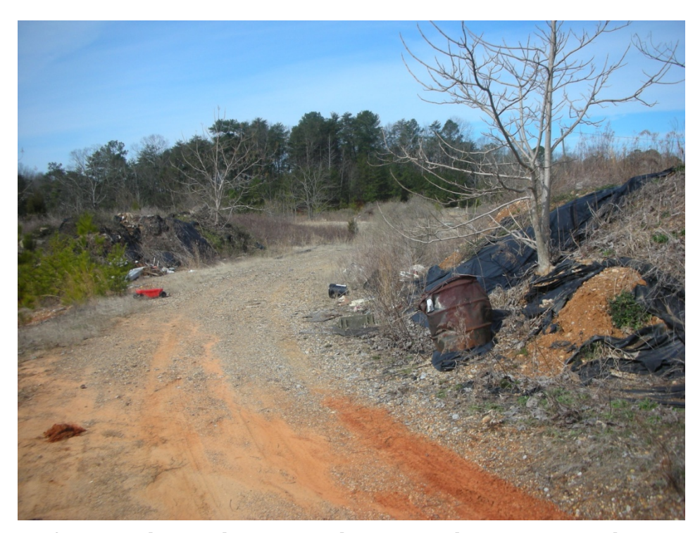
Piles of potentially oil-contaminated soil, covered with plastic