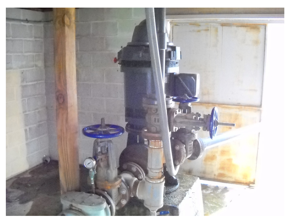
On-site production well used in pump and treat system