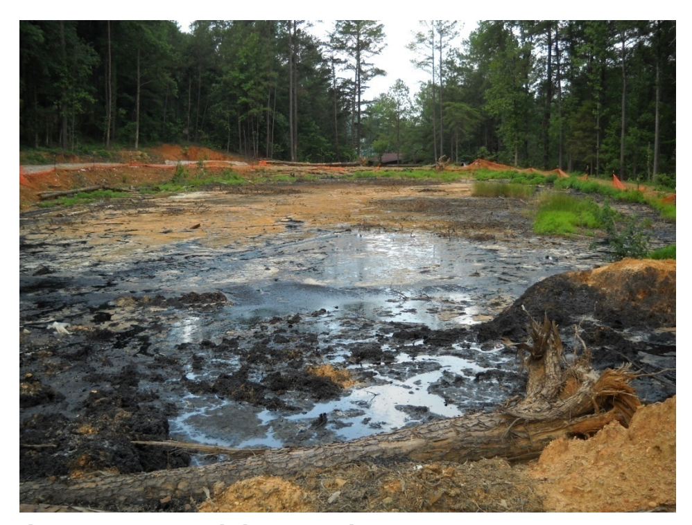
Main lagoon containing tall oils and asphalt-related waste