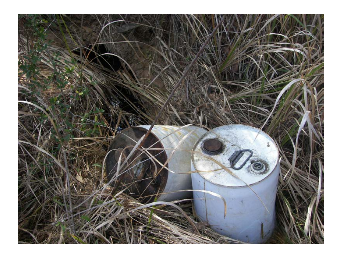
Abandoned containers with used oil at the Bucks Oil Spill Site

The Buck Oil Spill Site is a spill/abandoned container site located on Weaver Road in Bucks, AL. The ADEM Mobile Office of Field Operations was contacted by a concerned citizen who noticed numerous containers abandoned along Weaver Road in Bucks, AL. The containers held used oil and grease, and due to the location (the bank of a small creek) and the rainy weather at the time of discovery, it was a high probability of a release to the surface water pathway. Field Operations personnel contacted and emergency response contractor and the materials were removed and disposed of in the appropriate manner. No further action is expected to be necessary for this site.