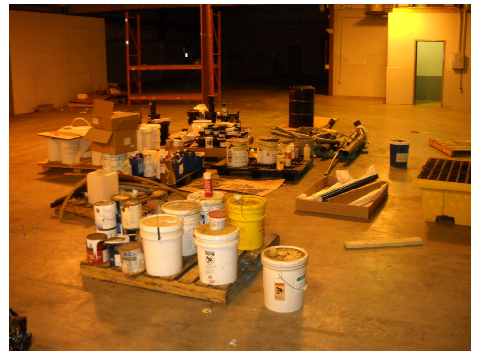
Small containers of hazardous chemical products and wastes