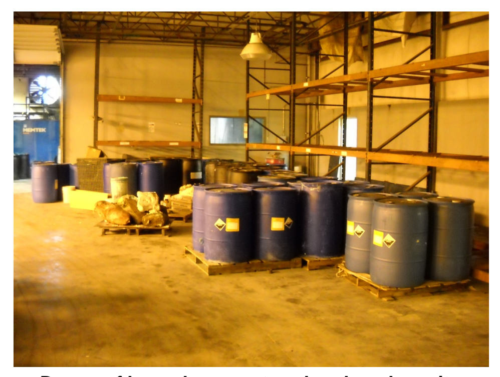
Drums of hazardous wastes abandoned on-site