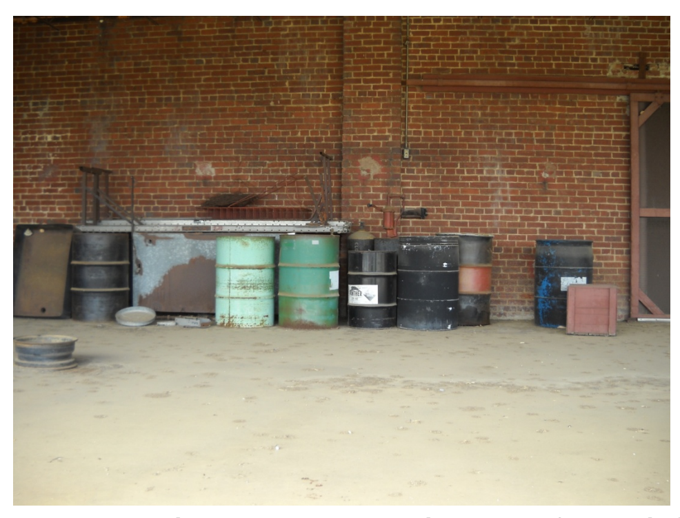
Drums and containers staged on loading dock of old building

In August 2012, Assessment Section personnel traveled to the site to evaluate the drums and document conditions on the property. During the investigation, ADEM personnel observed several drums and other containers staged on the loading dock of an older brick structure at the corner of Moore Avenue and 12<sup>th</sup> Street. There were eight (8), 55-gallon drums, four of which contained unknown liquids. Two of the drums were missing bung caps, and a faint petroleum odor was detected in their vicinity. ADEM personnel also observed one (1), 35-gallon drum, one (1), 5-gallon bucket, and one acetylene gas cylinder. The 35-gallon drum was empty and had a caustics placard affixed to it. Assessment Section personnel acquired tax information for the property and located the owner. In September 2012, the owner had the contents of the drums tested, showing that they contained honing oil, diesel fuel, mineral spirits, and caustic cleaning solution. In October 2012, the drums were removed from the site and taken to an appropriate disposal facility. Final oversight costs were charged to the AHSCF for this fiscal year. At this time, there are no further actions planned under the AHSCF program.