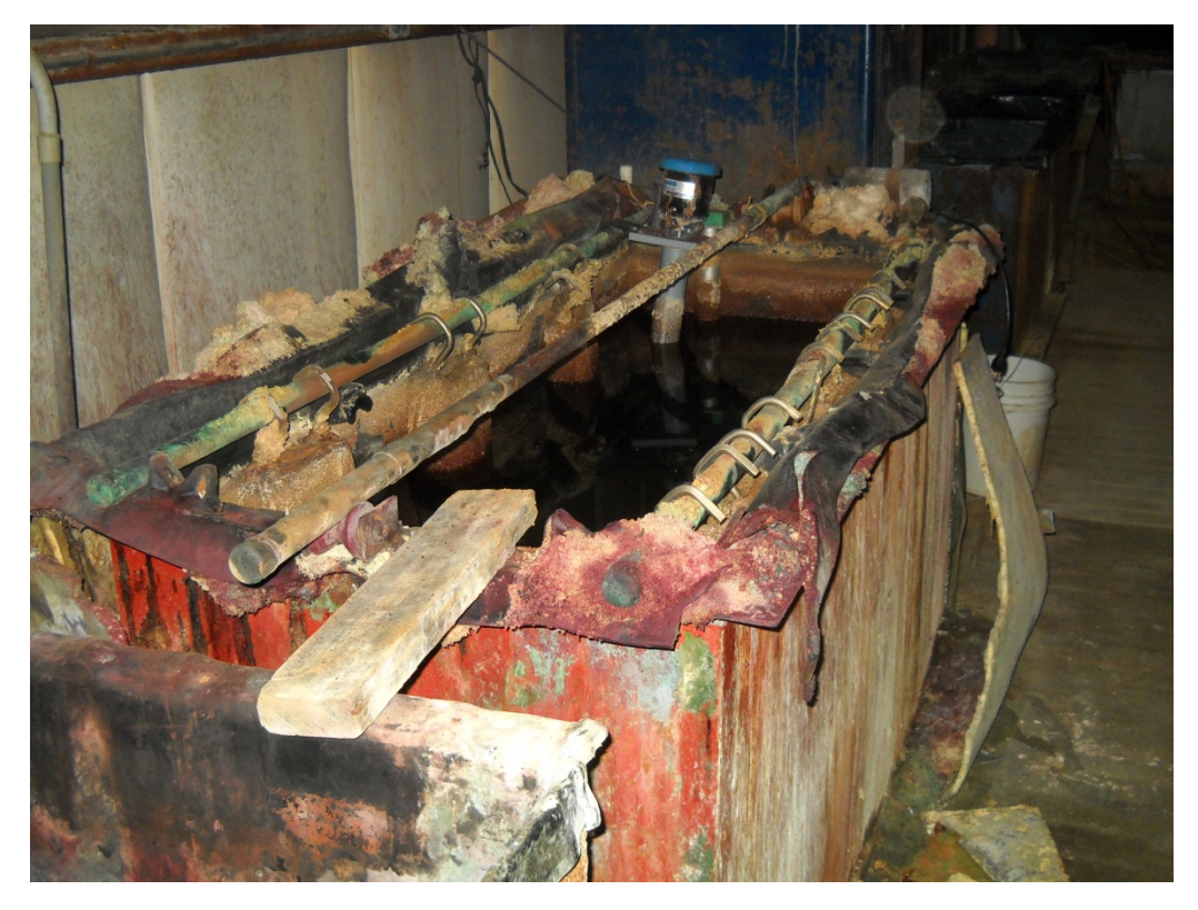
Liquids in Plating Vats, A-1 Plating, Tuscumbia, AL