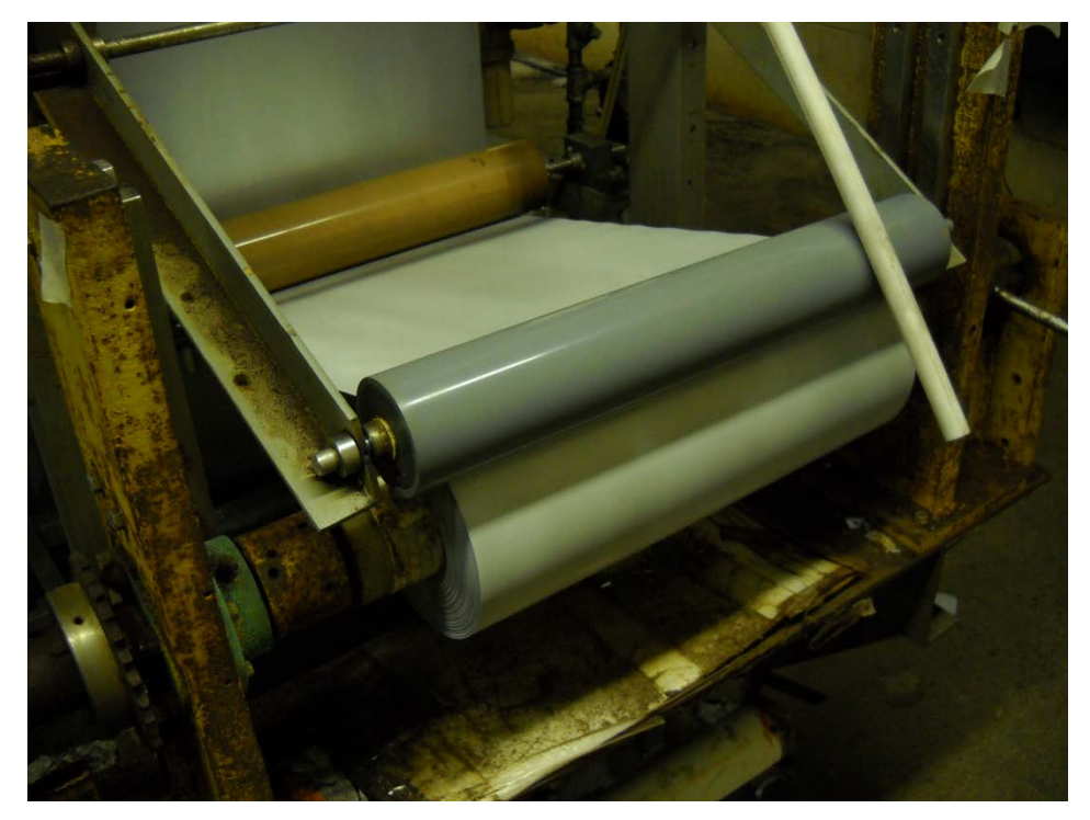
Aluminum foil rolls in etching machine