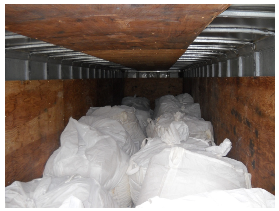
Sacks of borate material found inside tractor trailers