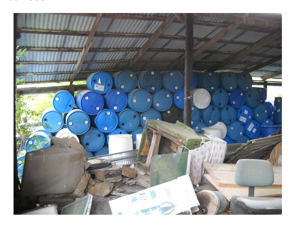
Drums in the Barn area at Vernon Highway 18 Drum Site