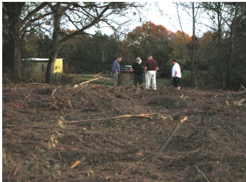
Gunnells Road Xylene Drum Elmore County, Alabama