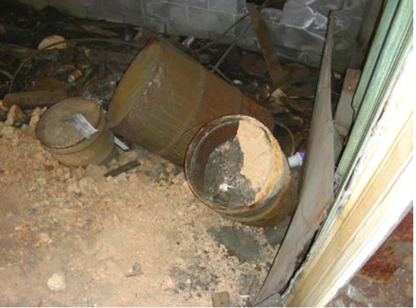
Abandoned Plating Vats and Sludges at Broad Wheels Inc, Oneonta, AL

ADEM will utilize all its resources to ensure the site is remediated. Hazardous waste regulations still apply to the site, which requires the owner/operator to remediate the site. ADEM is also seeking assistance from the EPA Superfund Program to further investigate the entire site.