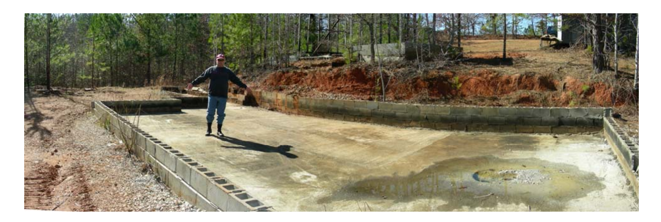
Secondary Containment for Former Above-Ground Storage Tanks Holding Waste Oil at McCullough Oil Recycler, Verbena, AL

These wastes were removed from over 100, 55-gallon drums and 20 above-ground storage tanks staged around the area. Approximately 69,000 pounds of metal were recycled. Total EPA costs were approximately $252,323. No further action is planed for this site by EPA or ADEM regarding the CERCLA or the AHSCF programs.