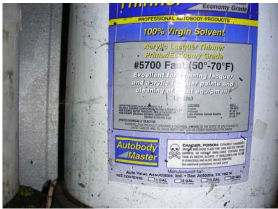
Materials Left at the Broad Wheels Site Oneonta, Alabama

all plating vats had been removed except for several at the eastern end of the building that contained sludge and other unknown liquids. The area where other vats had been located had been filled with material which appeared to be plating sludges and other industrial wastes. Two wastewater treatment tanks were also present, each with a volume of approximately 1000 gallons. Each tank contained several hundred gallons of wastewater treatment sludge that could be RCRA listed or characteristic hazardous wastes.