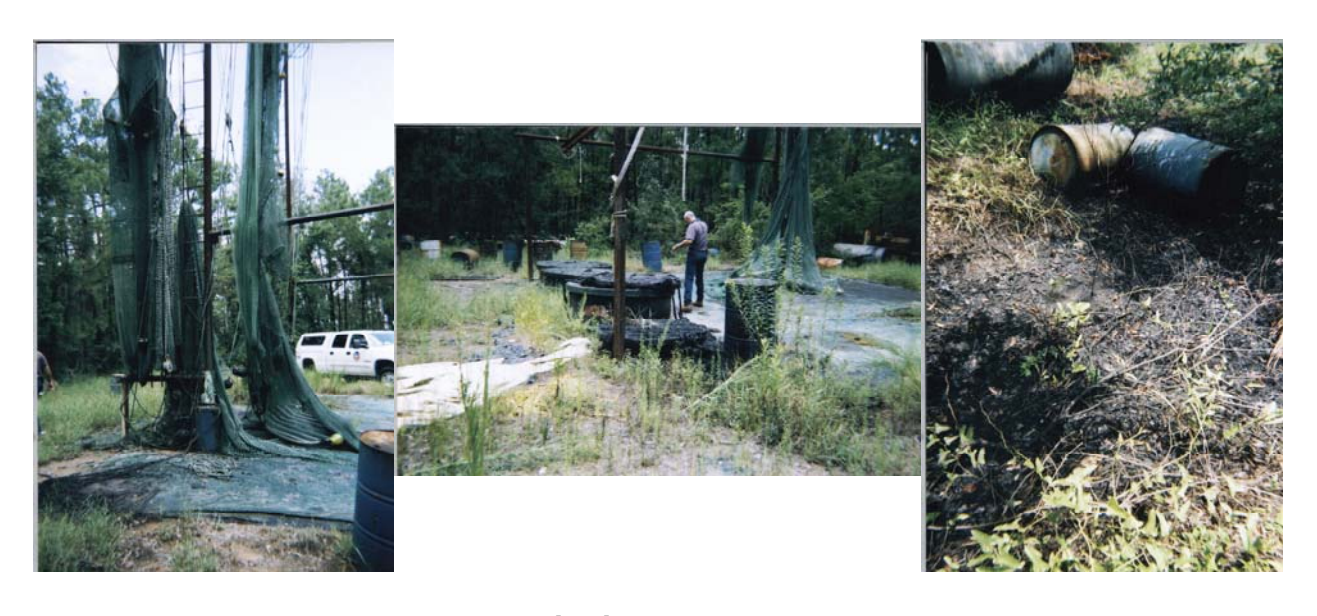
Drums, Nets, and Dipping Vats at Bayou La Batre Before Cleanup