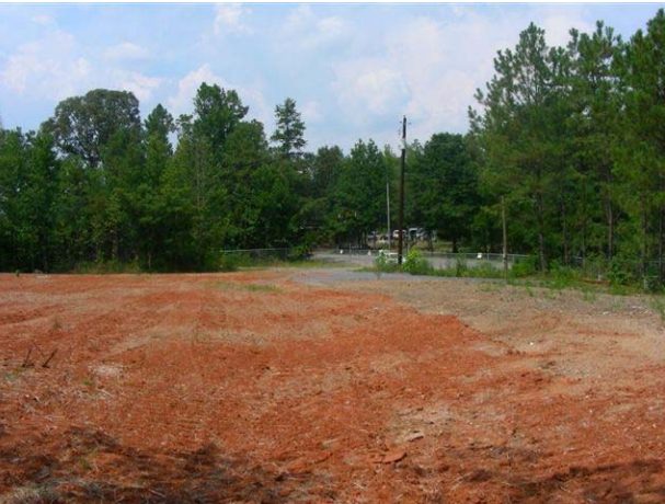
Site After Cleanup by EPA