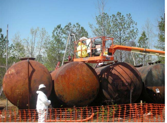
Above-Ground Storage Tanks during Removal Actions by EPA