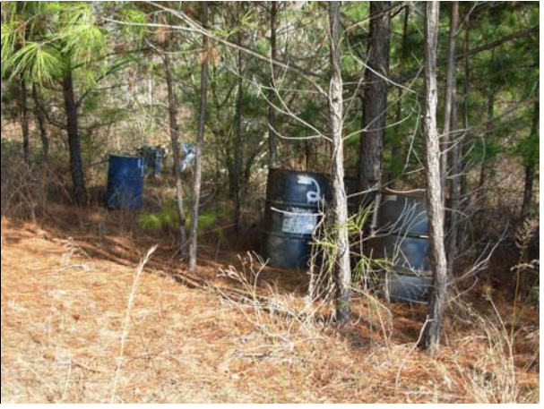
Etowah County Humane Society Drums, Gadsden, Alabama

drums, and took the samples to the ADEM Laboratory in Montgomery. Analysis of the samples indicated the materials were mixtures of waste oils, hydraulic fluids, and gasoline. These drums were staged on-site and then transported to a fuel blending operation for disposal of the wastes. No further actions are anticipated for this site.