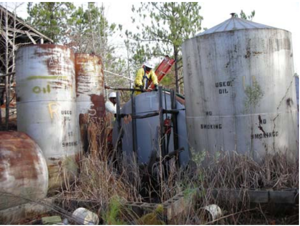
McCullough Oil, Verbena, AL, (before cleanup)

Assessment and remediation activities began in November of 2006, and were completed by March of 2007. Materials removed from the site were as follows: