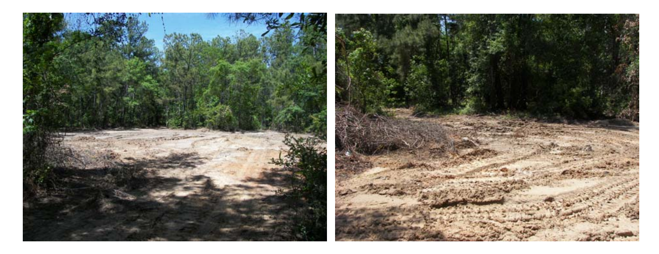
Powell Avenue Drum Site, Bayou La Batre After Cleanup