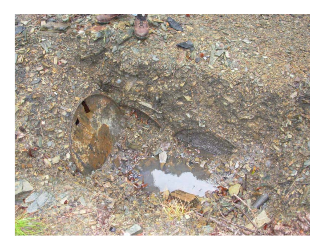
Buried drums located on Turner Property

needed to sample and remediate the site. ADEM staff are currently working with the owner to ensure proper removal and disposal.