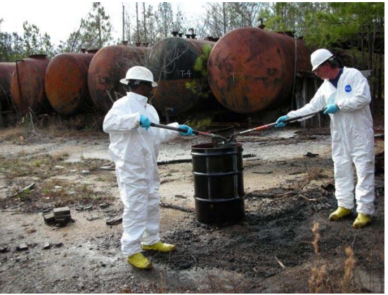
Cleanup of Pond and Soils around Storage Tanks by EPA Personnel