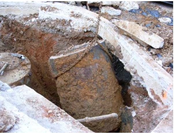
Removal of Tanks from 19<sup>th</sup> Street, Birmingham, Alabama