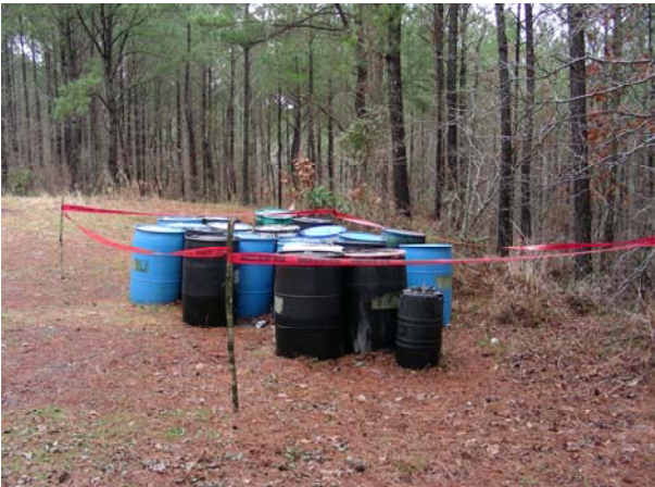
Groves Abandoned Drums, Hancock Wildlife Management Area near Ohatchee, AL