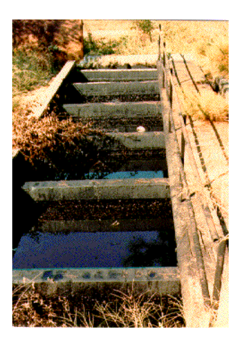
Abandoned Drums and Dip Vats at Cracker Asphalt, Hale County, Alabama