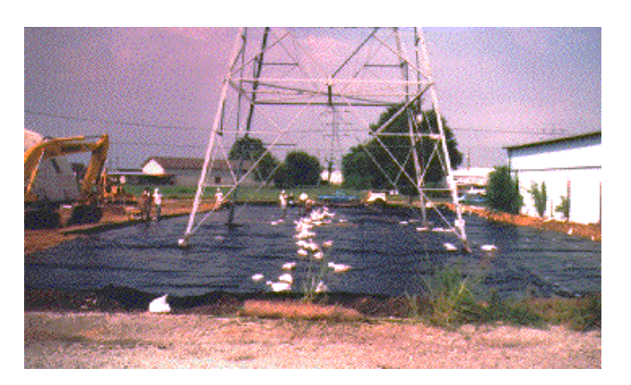
Excavation and installation of the liner at Southland Chemicals/Airpro