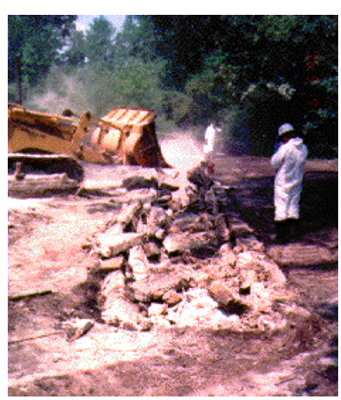
Excavation and destruction of dip vats at Cahaba Wood Preserving