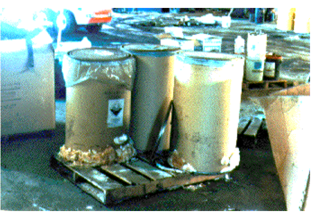
Drummed materials abandoned at Star Plating in Tuscumbia, Alabama

Star Plating is located in Tuscumbia, Alabama. It is the site of an abandoned electroplating facility which operated from the early 1970s until 1993. The site was abandoned with over 100 55-gallon drums of corrosive and hazardous chemicals, including cyanide, in containers of uncertain structural integrity. Soil contamination has also been detected outside the building. The AHSCF provided funds for the contractual stabilization and sampling of the materials inside the building to prevent the further migration of materials to the surrounding environment. The US. EPA has conducted a Removal Site Assessment at the site to determine the extent of contamination and possible criteria for removal of contaminated materials.