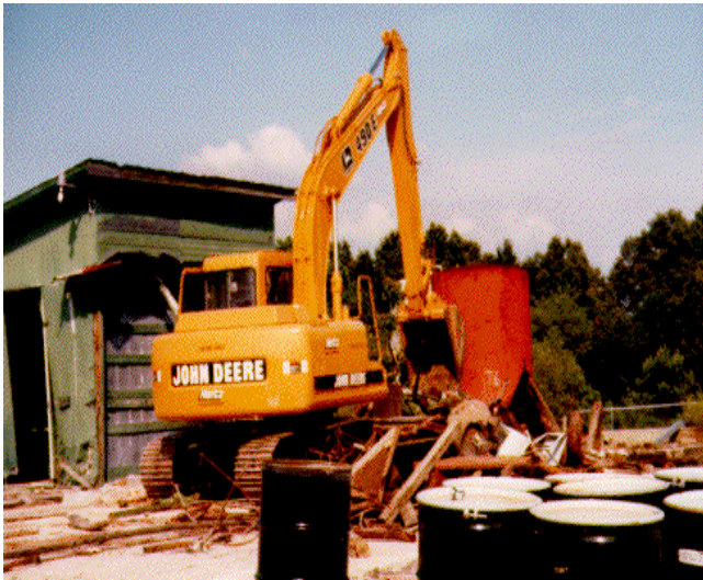
Fullco Lumber Company tanks prior to removal by EPA ERRB