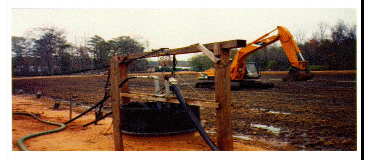
Brown Foundation, Brownville, Tuscaloosa County, Alabama

Approximately 5 of the total 35 acres within the site are being bioremediated. The Foundation charter calls for the disbursement or sale of all landholdings by a prescribed date and the Foundation is investigating avenues for the release of those portions of the site that can be considered uncontaminated. ADEM is developing a plan and course of action whereby that can be accomplished. Funds charged against the Site include personnel time for document review and site inspections.