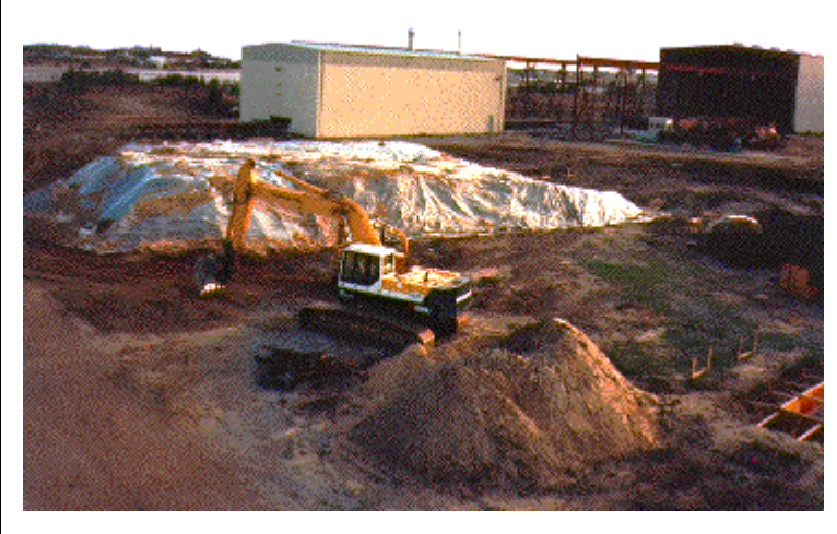
Excavation at the Alabama Shipyards

The Alabama Shipyards site consisted of a large area of soil contaminated with various petroleum hydrocarbon by-products. Soil contamination resulted from decades of washing train cars, fueling of ships, and other practices at the Shipyard. The AHSCF provided funds for periodic site visits to ensure that the total petroleum hydrocarbon (TPH) impacted soil was consolidated for use as a compacted structural fill in the construction of parking lots on the Shipyard property. The AHSCF also provided funds for the periodic sampling of the soil on site.