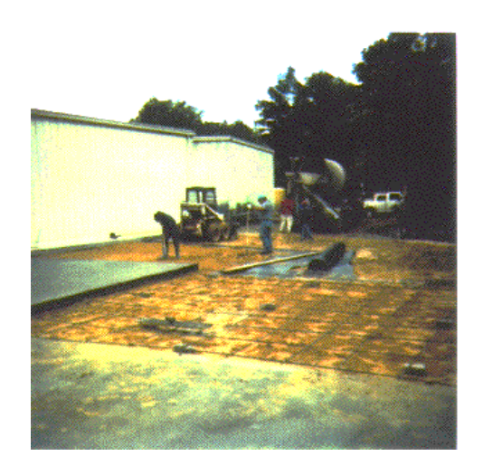
Hall Chemical, Arab, Marshall County, Alabama