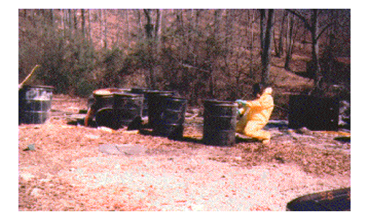
Drum Sampling at Worley Drum site in Anniston, Alabama