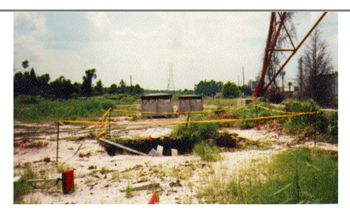
Buchanan Lumber Company, Mobile, Alabama