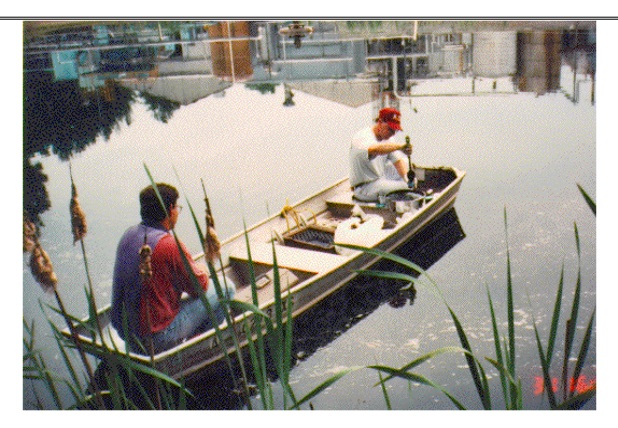
Field Operations Personnel Performing Water and Sediment Sampling at Hall Chemical, Arab, Marshall County, Alabama