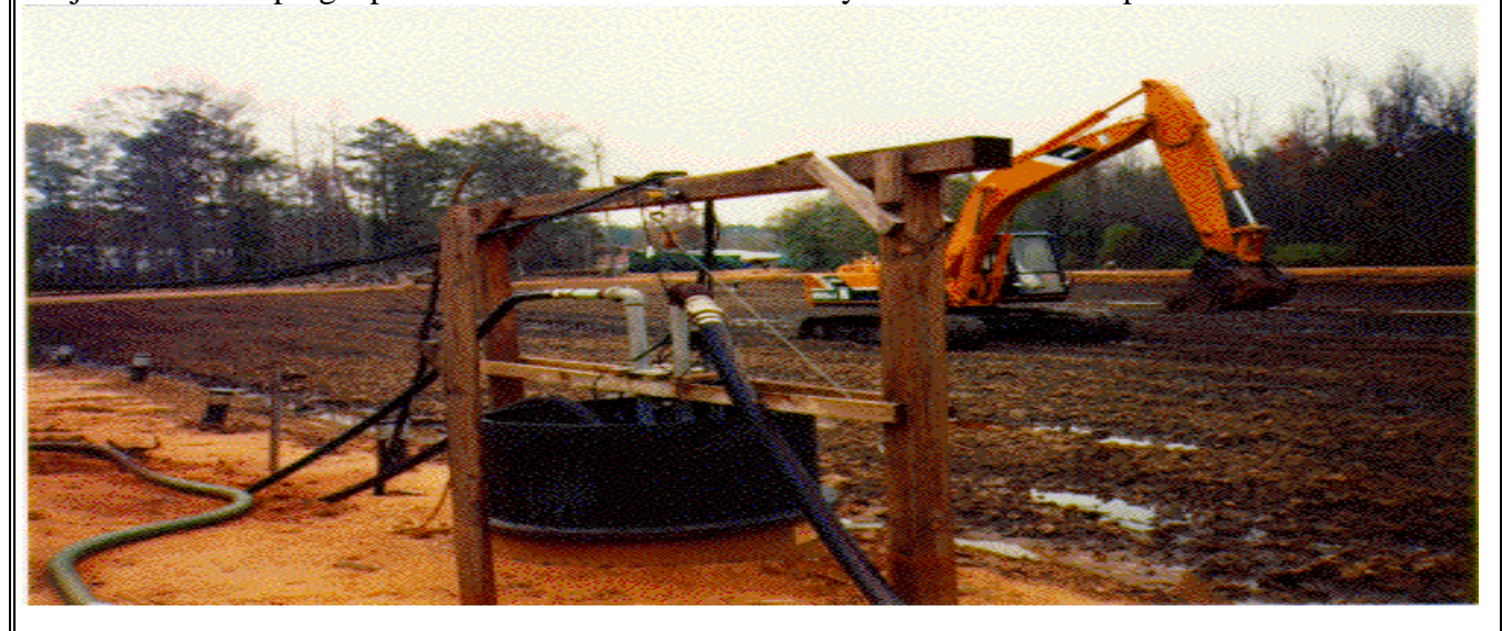
Brown Foundation, Brownville, Tuscaloosa County, Alabama JEFFERIES LANDFILL Lawrence County Reference # 9037

About 5 of the total 35 acres within the site are being bioremediated. The Foundation charter calls for the disbursement or sale of all landholdings by a prescribed date and the Foundation is investigating avenues for the release of those portions of the site that can be considered uncontaminated. Special Projects is developing a plan and course of action whereby that can be accomplished.