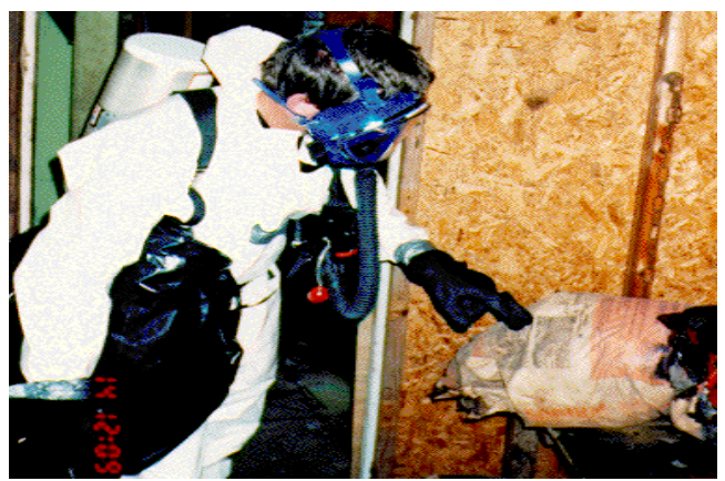
Inspecting Waste, Montgomery Plating Montgomery, Alabama

Phase II cleanup activities will include disposal of staged materials and cleanup of the building interior and vats. The AHSCF provided funding for a qualified contractor to perform Phase I activities and to determine Phase II activities. The AHSCF also provided funding for staff to evaluate the initial threat to public health and the environment, to provide for oversight during the ongoing cleanup process, and to collect/analyze samples of the contaminated soil in the areas of concern. It is anticipated that ADEM will recommend further cleanup of the site at the federal level.