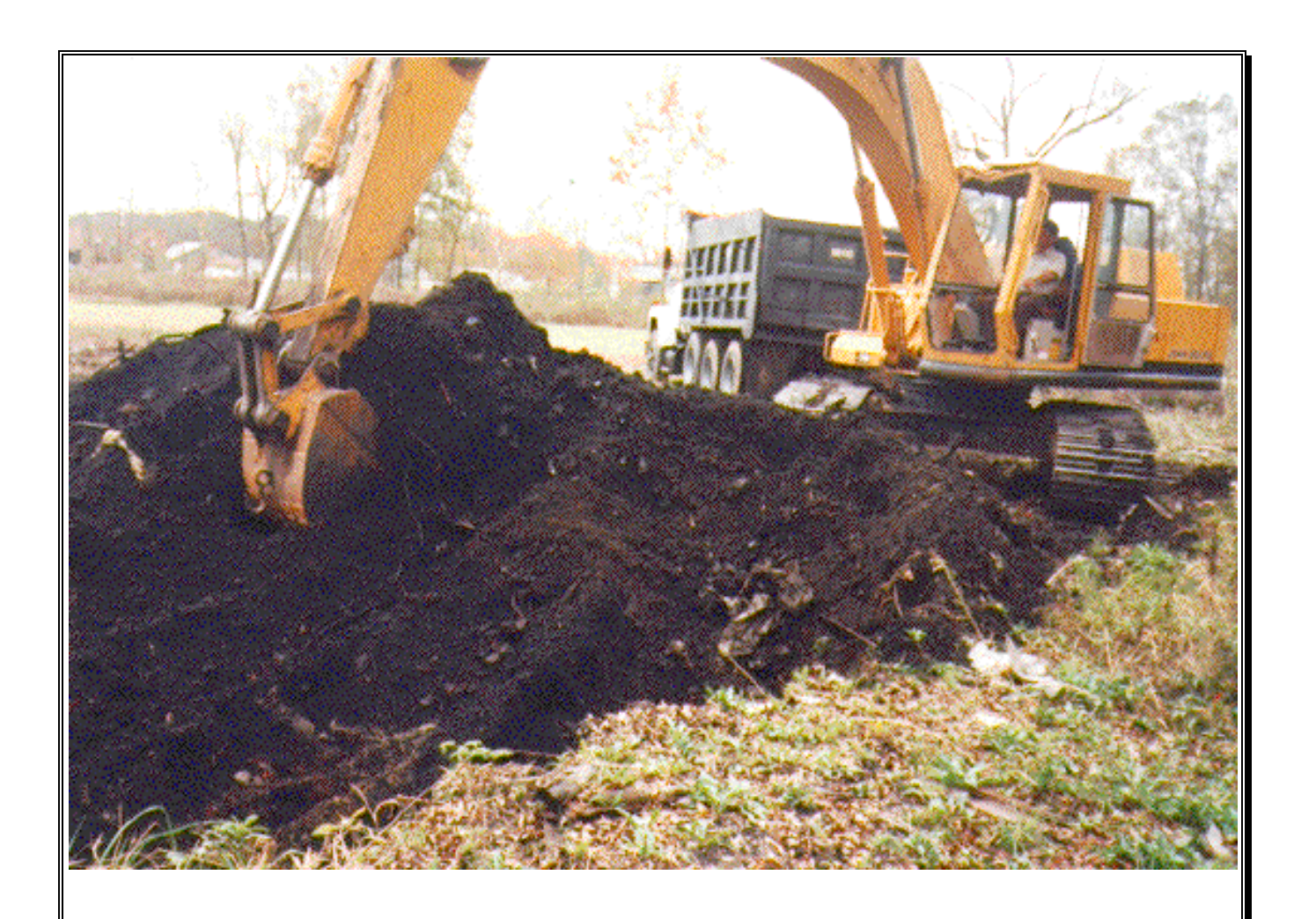
Scott Junkyard excavation, Brewton, Escambia County, Alabama