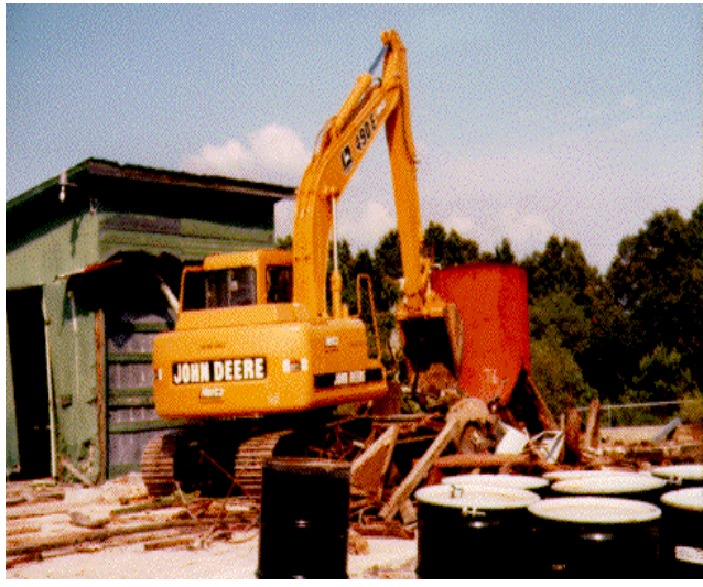
Fullco Lumber Company tanks prior to removal by EPA ERRB