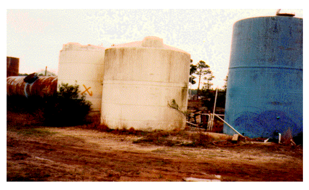
Caren Inc., tanks, Gulf Shores, Baldwin County, Alabama

The former Caren Inc., a former sludge treatment facility, is located in the City of Gulf Shores, Alabama. When the site was abandoned, 4 large tanks were left on the property by the former owner. A large amount of a sludge conditioner used in the former operations was left in the tanks. After the initial investigation, a qualified disposal firm was contracted to disassemble the tanks and the sludge conditioner was properly disposed of at the Timberland Landfill in Brewton, Alabama.