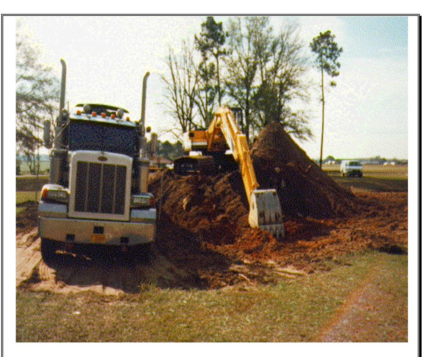
Atmore Aluminum Waste Pile, Atmore, Escambia County, Alabama