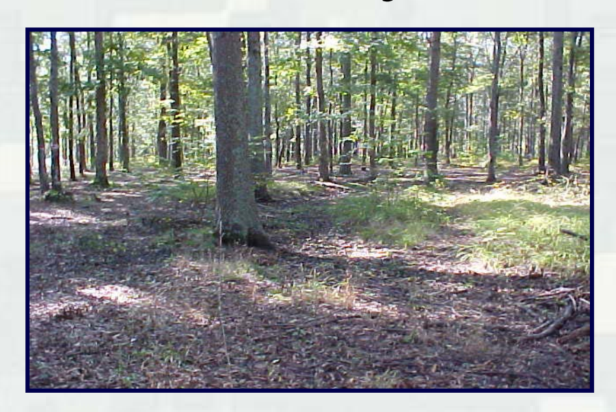
... others can be quite difficult